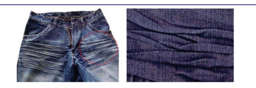
Fig.1: Localised application of Saracrease PW

It is specifically designed to impart soft wrinkles at any desired location on a garment, as shown in Figure 1. Unlike conventional glyoxal