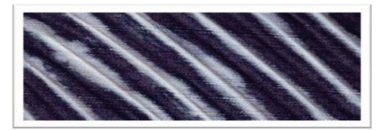
Fig.3: Fabric after treated with Helar PPN

resins or melamine resins, it imparts naturally soft and sharp creases without altering tone change or patch/ring formation after drying and curing. Finishing with Saracrease PW is durable to multiple home launderings, with minimal impact on tear/tensile strength.